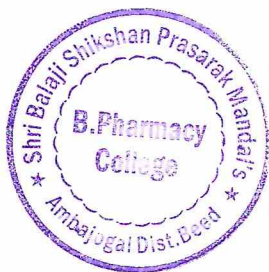
Principal Principal B. Pharmacy College, Ambajogai.