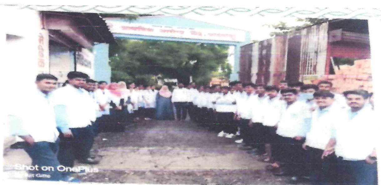
Student Visit at Primary Health Care Center Ghatnandur