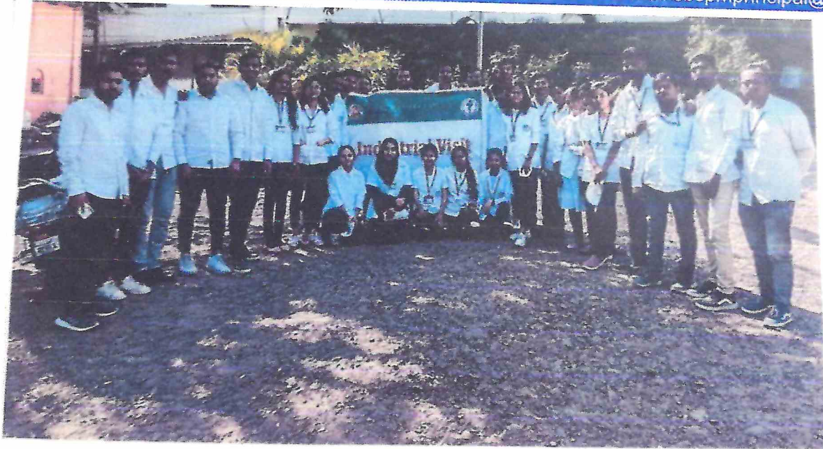
Industrial Visit Photo