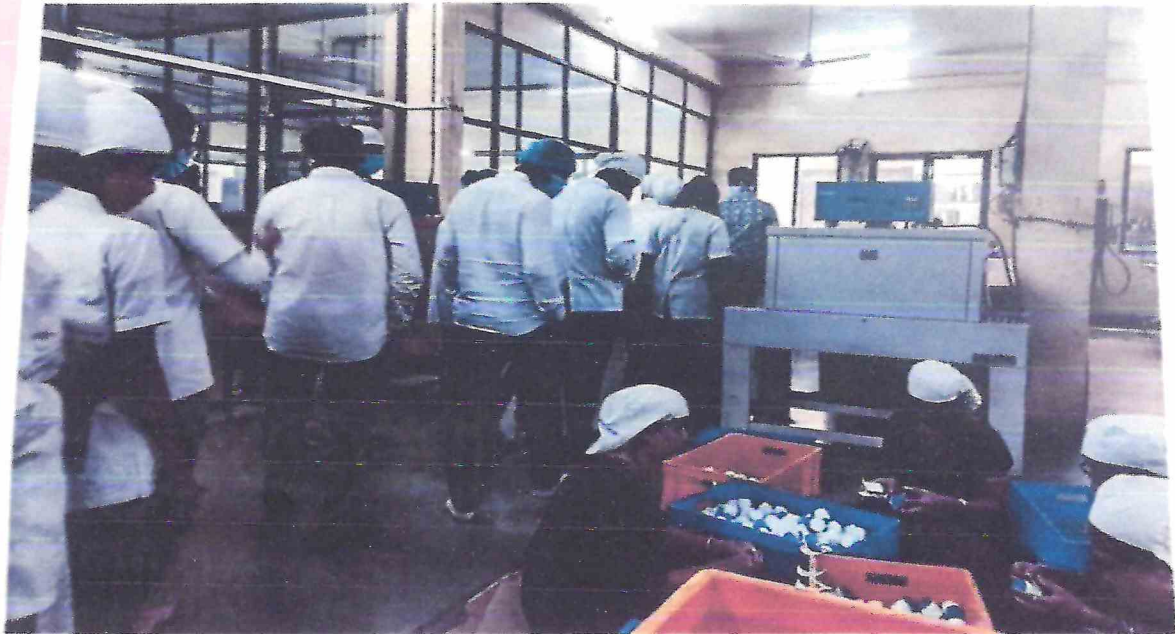
Work Demonstration at Lab