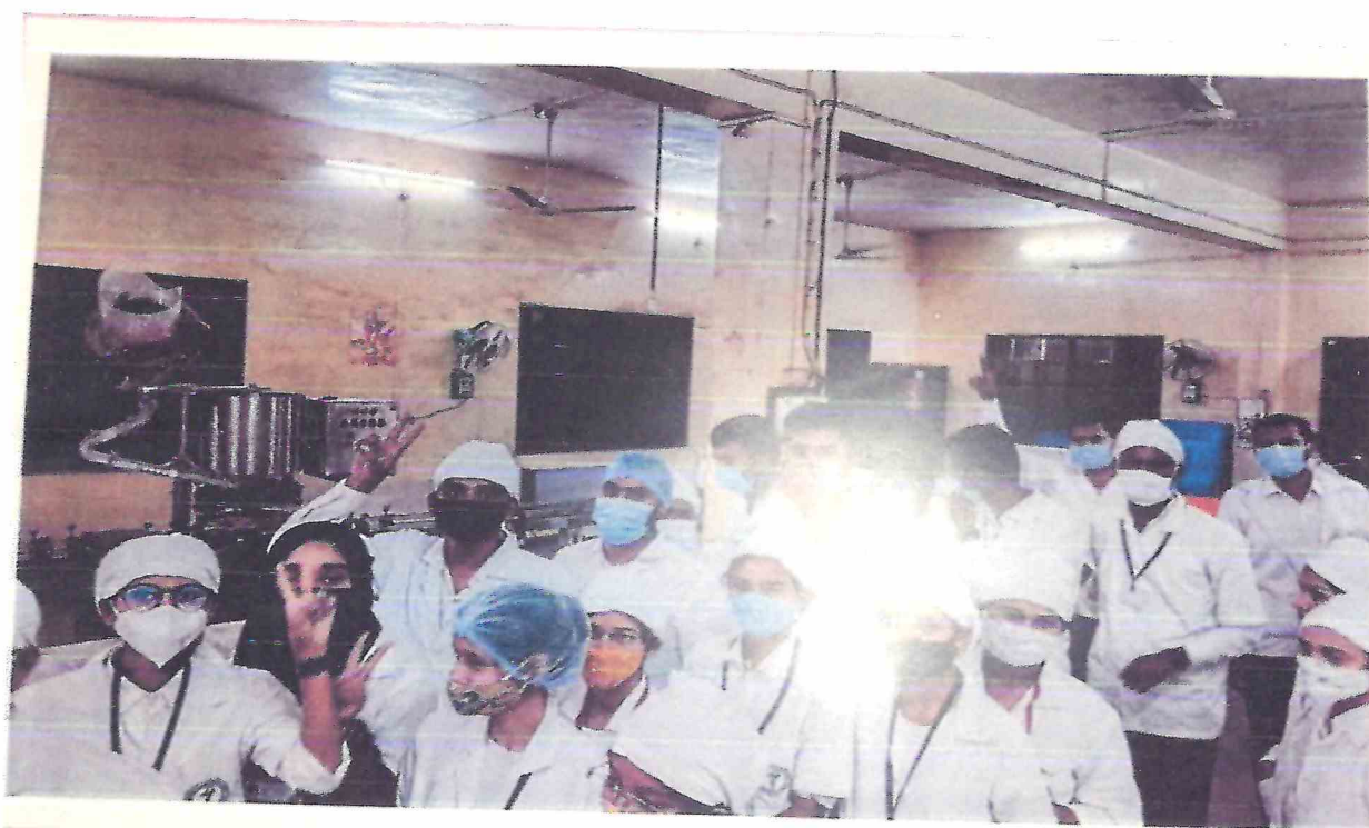
During Demonstration at Industrial Lab