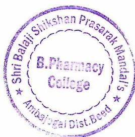
Signature of Co-ordinator