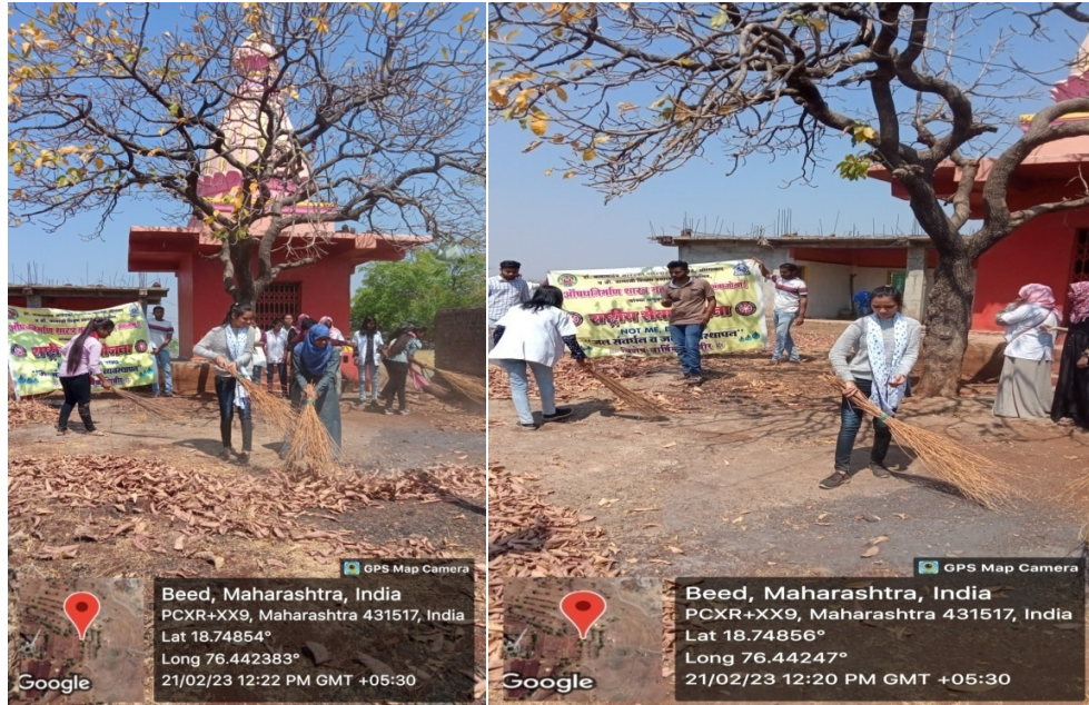
Student,s during cleaning premises of Mandir under Swachhta abhiyan