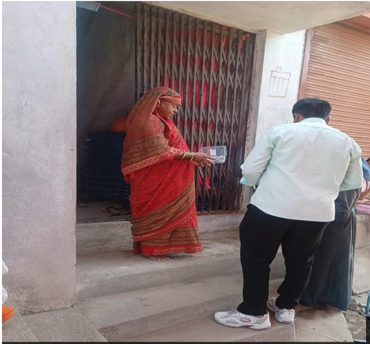
Students during checking the medicine and guiding them regarding time of medication