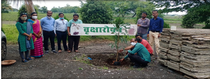
Faculty during tree plantation