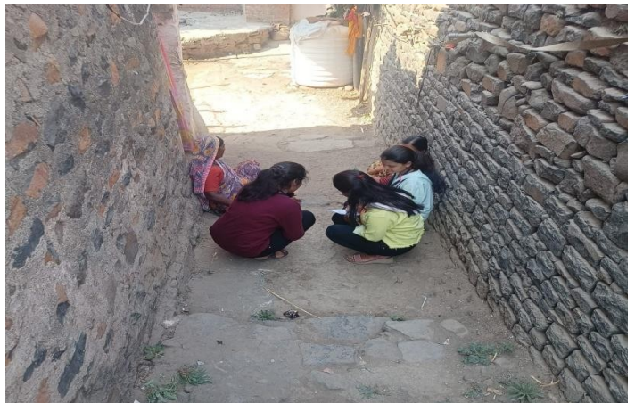
Student during counseling of villagers