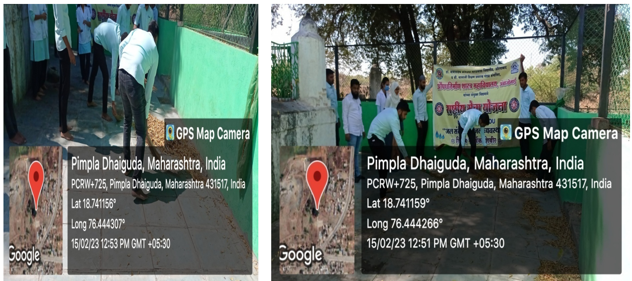
Cleaning of Dargha premises under Swachhta abhiyan