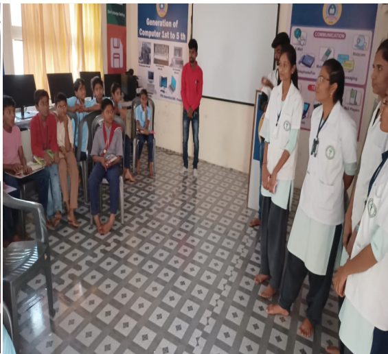
Student during interacting with student's of different school regarding environmental awareness