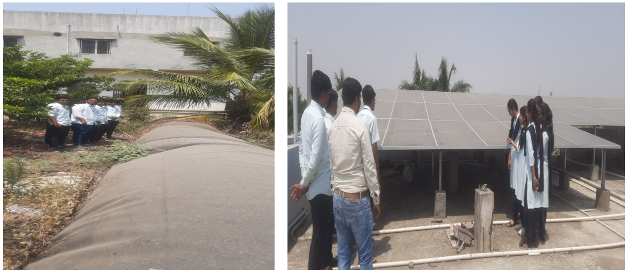
During awareness regarding solar and Biogas