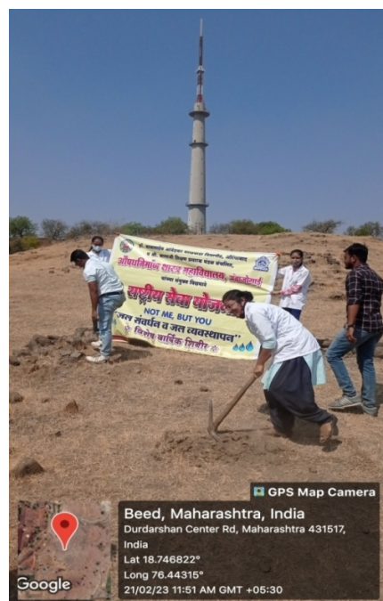
Student during Paani adva pani jirva event making pits for water