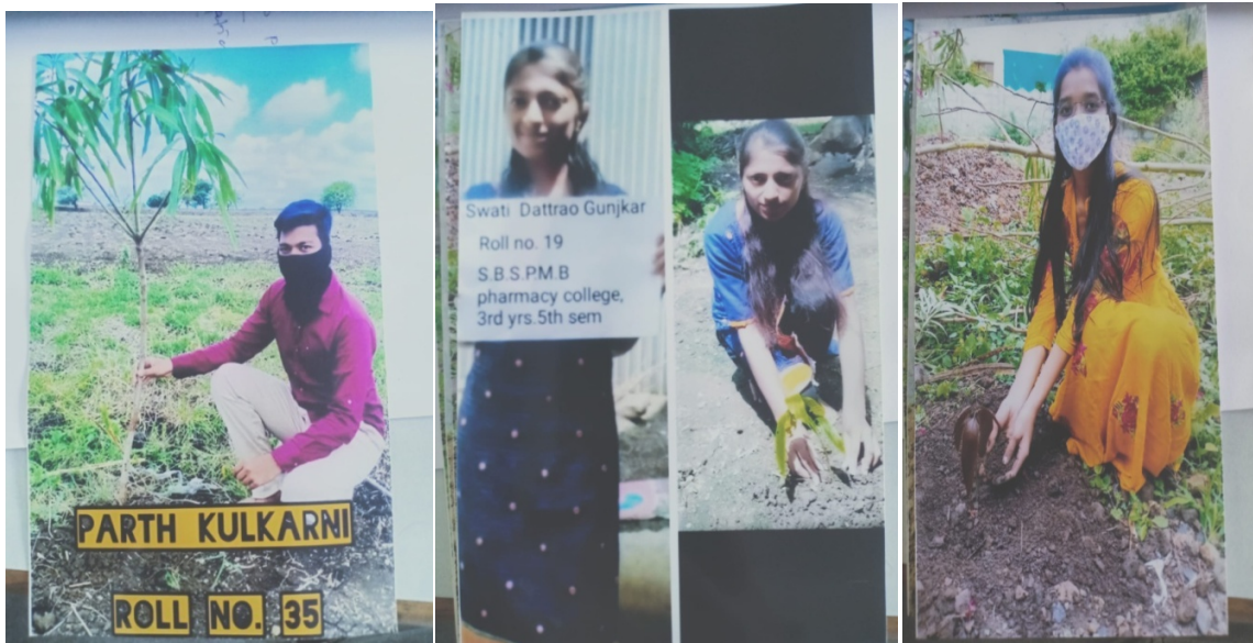
Student's planting trees during forest festival in their areas